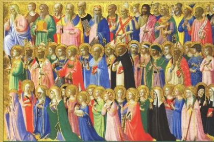
The Forefathers of Christ with Saints and Martyrs, Fra Angelico

Our Church Directory is powered by Instant Church Directory .